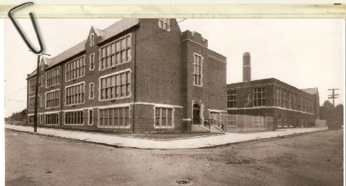
Original Building Charles B. Lore School 1932